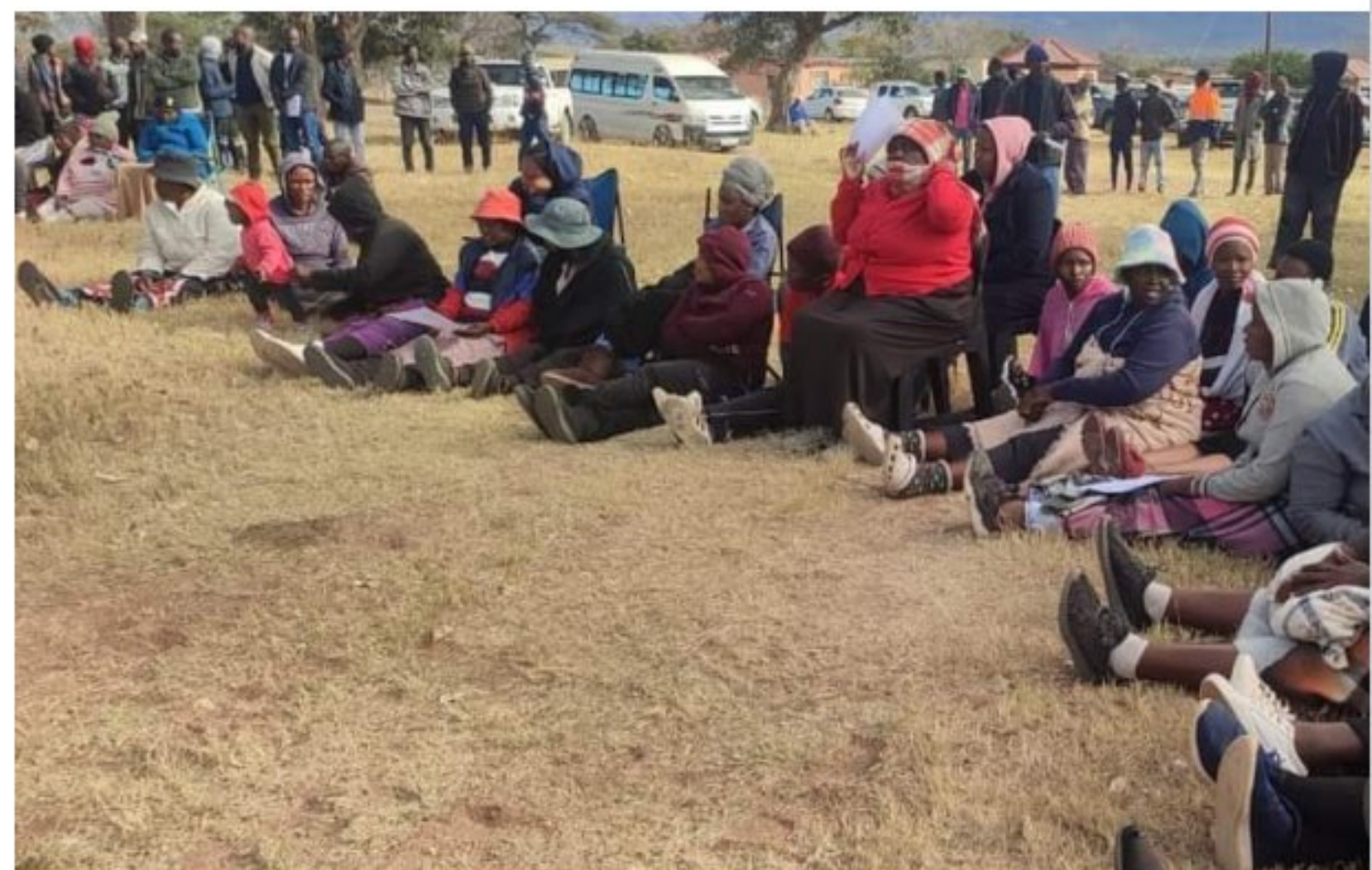
Mayor Thamaga breaks ground, marking the commencement of the construction of Mochemi Access Road.